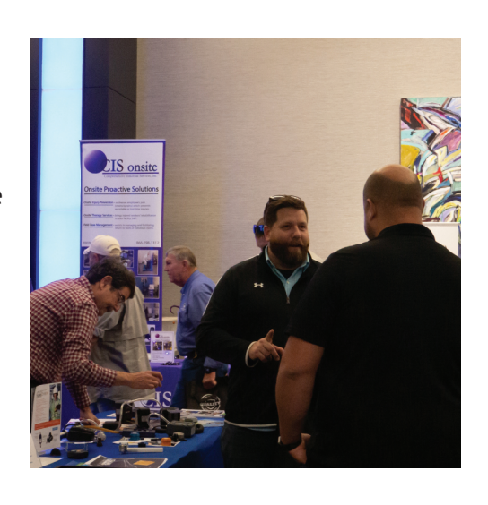
The exhibitor space is located outside the main conference area, close to the conference sessions to maximize vendor visibility and access.